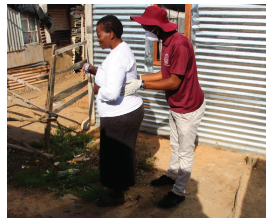
A CHiP provides physiotherapy assistance outside the client's home to help the client produce sputum.

ART is successful in restoring HRQoL of HIV-positive individuals to that of HIV-negative individuals in this general population sample, providing further support for scale-up of testing and expansion of treatment to all HIV-positive individuals.